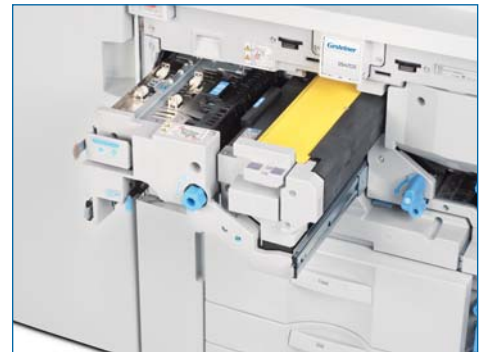
With Gestetner's new Trained Customer Replacement Unit (TCRU) design, a variety of components can be changed by trained operators, keeping production interruptions to a minimum and maximizing system uptime and availability.