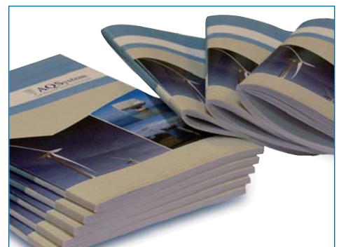
To cut costs and save time, Gestetner's unique Book Fold function, when combined with the BK5010 Booklet Maker, allows you to create professional booklets in-house.